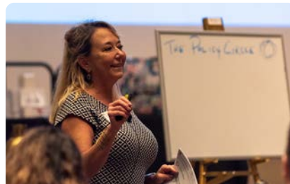
OCTOBER Half-Day Conference