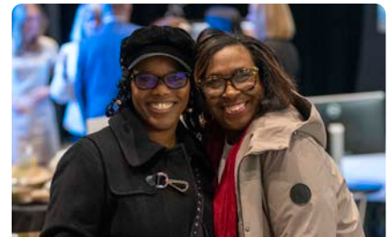
NOVEMBER Networking Social