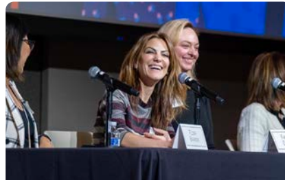
MARCH International Women's Day Luncheon