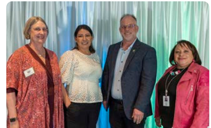
MAY Champions of Change Awards