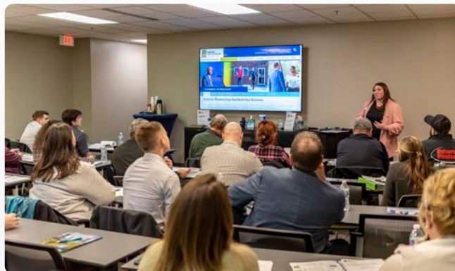
Projected Attendance: 20-30 per event