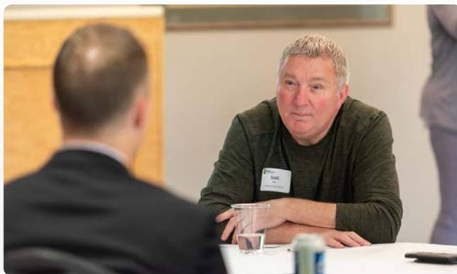
Projected Attendance: 50-75 per event